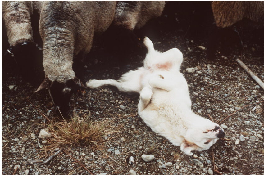
Fig 7.

Fig 7 shows what a dog looks like when it's being submissive. It is an innate behaviour, a coping strategy. A dog will show this behaviour when it's afraid of someone or something, and harsh training methods or abusing a dog may trigger this innate behaviour.