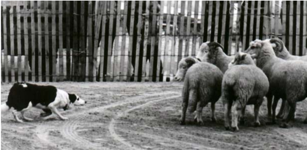
Fig 3.

The Retrievers' predatory motor pattern is;