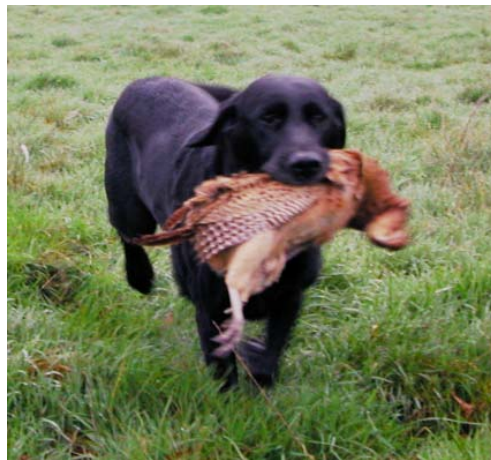
Fig 4.

Fig. 4 shows the Retriever's 'grab-bite' with a soft mouth so as not to bruise the flesh of the shot game.