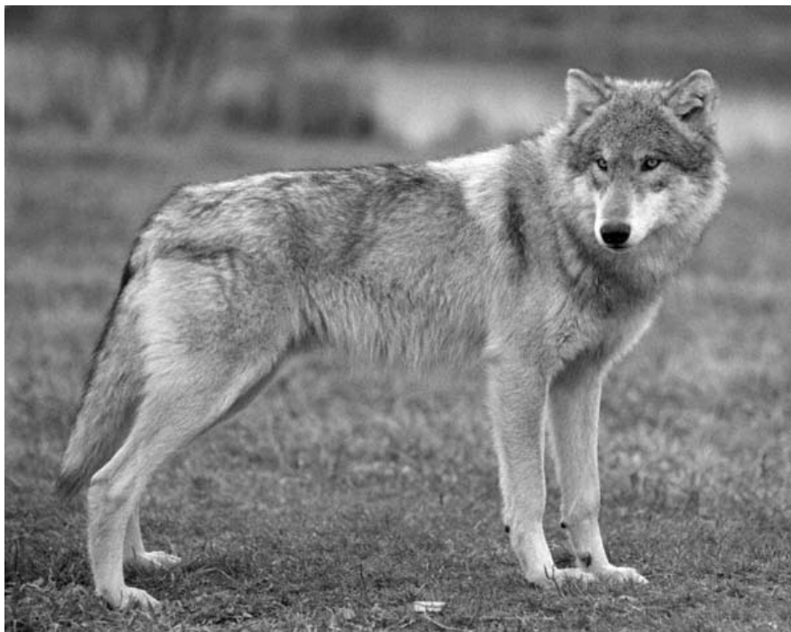
Fig 1. ( Canis lupus )

To understand why pack rules are considered out-dated, we need to understand dogs are not wolves. Science has identified that the dog ( Canis familiaris ) is descended from the wolf ( Canis lupus ). See Fig. 1